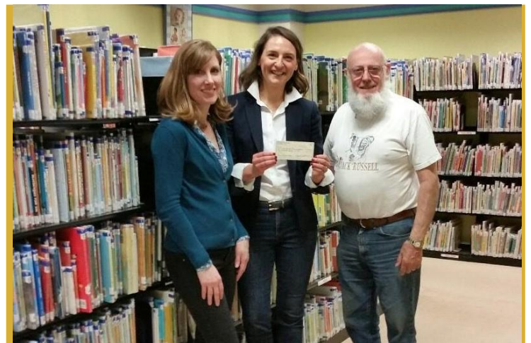
Accepting a donation from the East Hampton Lions Club to fund Children's Summer Reading.