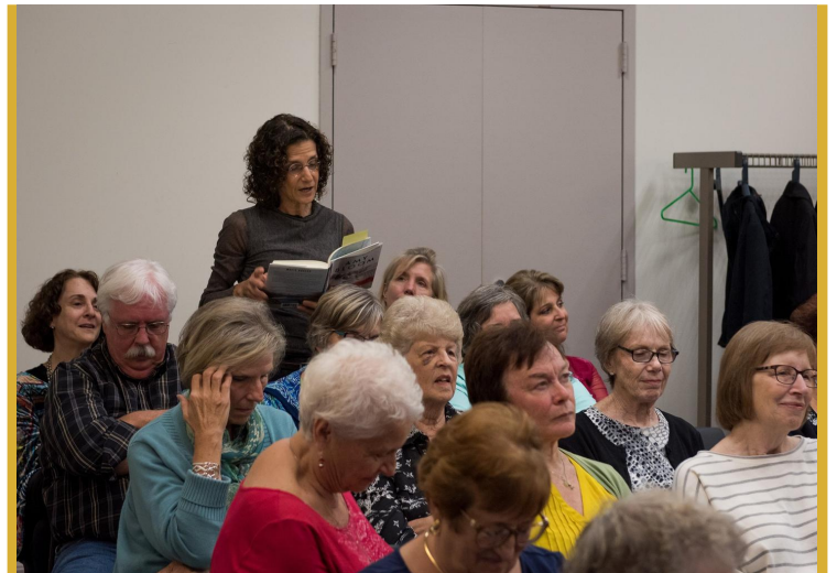
Patrons at an author talk with National Book Award Finalist and best-selling author Amy Bloom.